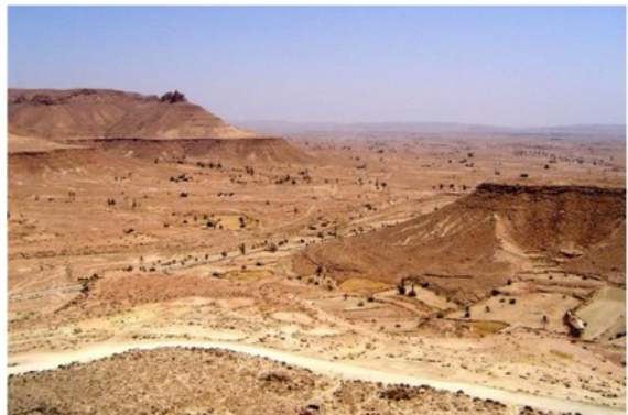
Fig. 47 Landscapes and cities

Look at the section of the map below showing Tunisia and Morocco. Can you identify the location of Kairouan in Tunisia (where Fatima used to live) and Fez in Morocco? The distance between these two cities is approximately 1,630 km. Fatima travelled with her father and her sister from Kairouan to Fez on camels in a caravan. Camels travel on average 40 km per day. How many days did it take Fatima and her family to reach Fez in Morocco? (Answer: 41 days!!!) Primary school students can draw a short line representing the distance a camel can travel in 1 day, and then count the number of times that short line goes between the two cities.