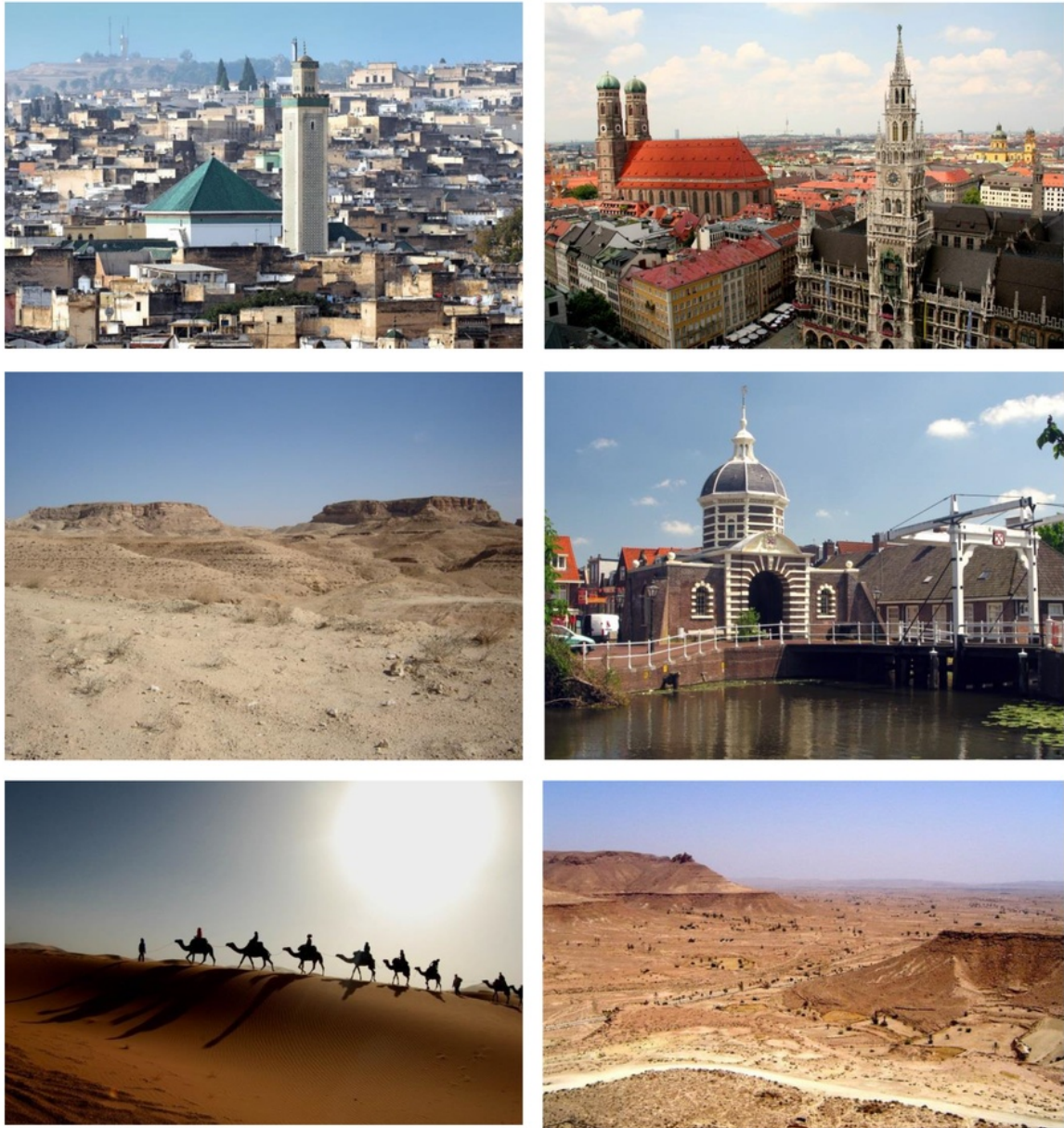
Fig. 47 Landscapes and cities (Credits: Wikipedia/Free)

Look at the section of the map below showing Tunisia and Morocco. Can you identify the location of Kairouan in Tunisia (where Fatima used to live) and Fez in Morocco? The distance between these two cities is approximately 1,630 km. Fatima travelled with her father and her sister from Kairouan to Fez on camels in a caravan. Camels travel on average 40 km per day. How many days did it take Fatima and her family to reach Fez in Morocco? (Answer: 41 days!!!) Primary school students can draw a short line representing the distance a camel can travel in 1 day, and then count the number of times that short line goes between the two cities.